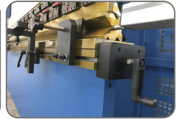
Manual Crowning System-Optional