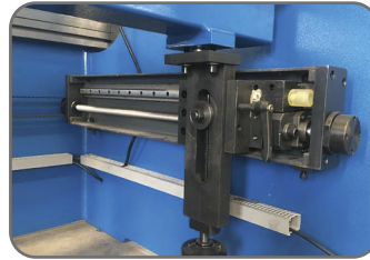
BackGauge with Linear guide