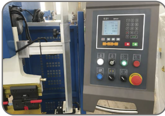
Estun E21 NC Control System