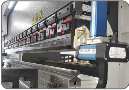
CE Confirmation with Laser Safe