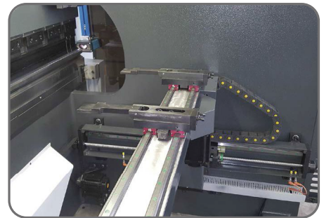
Back Gauge with Linear guide