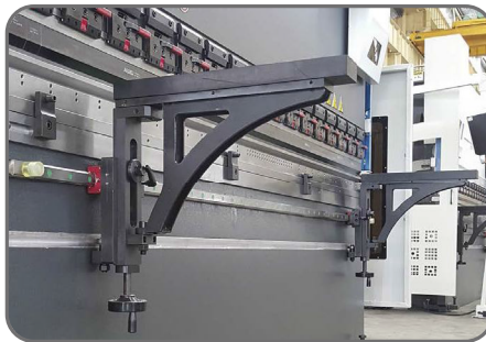
Front Arm with Linear Guide