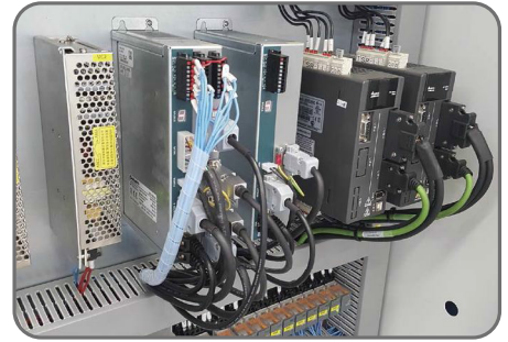
Delta Servo Drive